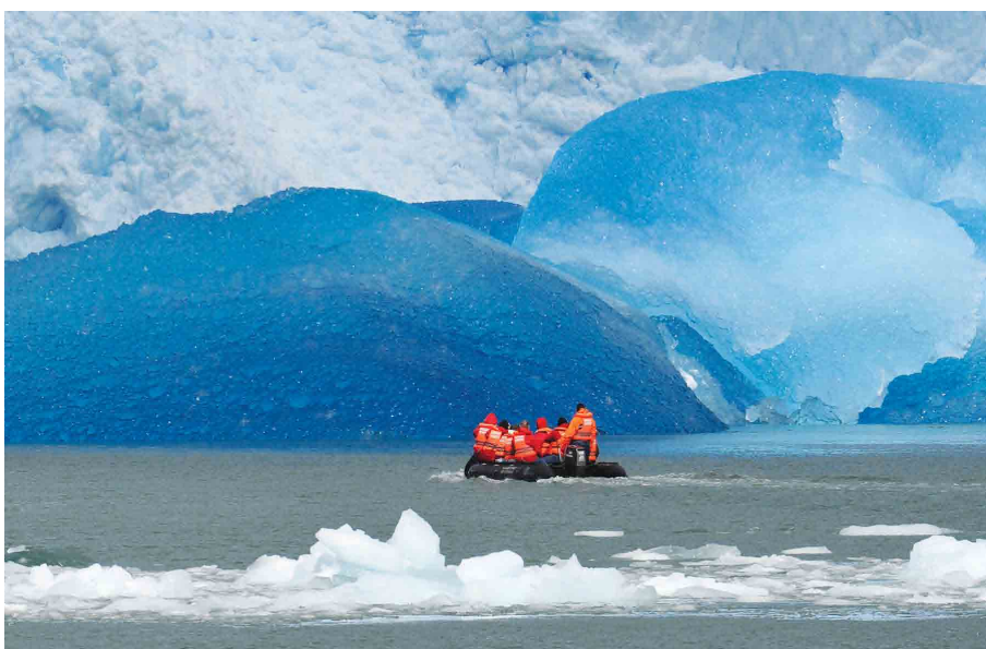
Top: Hiking provides unbeatable views. Left: A glacier expedition gives an up-close-and-personal look at Patagonia's giant ice formations. Bottom right: Seafood melds with fruit at Afrigonia.