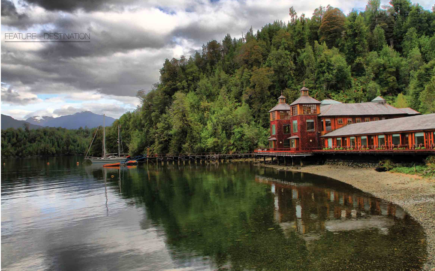
Top center: The cabin-like exterior of Puyuhuapi Lodge and Spa. Bottom right: Patagonia Camp's signature yurts are pure bohemian elegance.