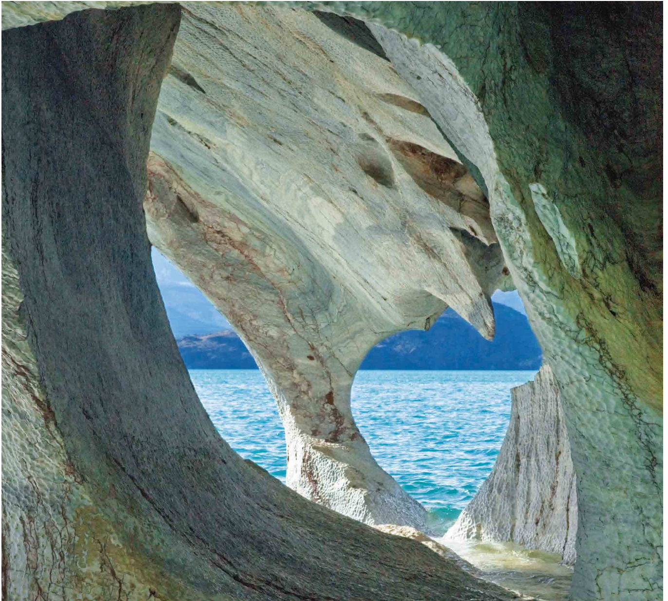
Above: Intricate marble stone formations are carved from millenia of erosion.

P atagonia has a seductive power; and it can't just be reduced simply to breathtaking views. Perhaps it's the vastness, the Tolkien-esque richness that pulls visitors in; the sense that you have entered another world and may not be able to find your way out. Verdant plains roll gently towards jagged, snow-capped spires; rushing white-water rivers flow into impossibly serene turquoise lakes – the region is awash with beautiful severities.