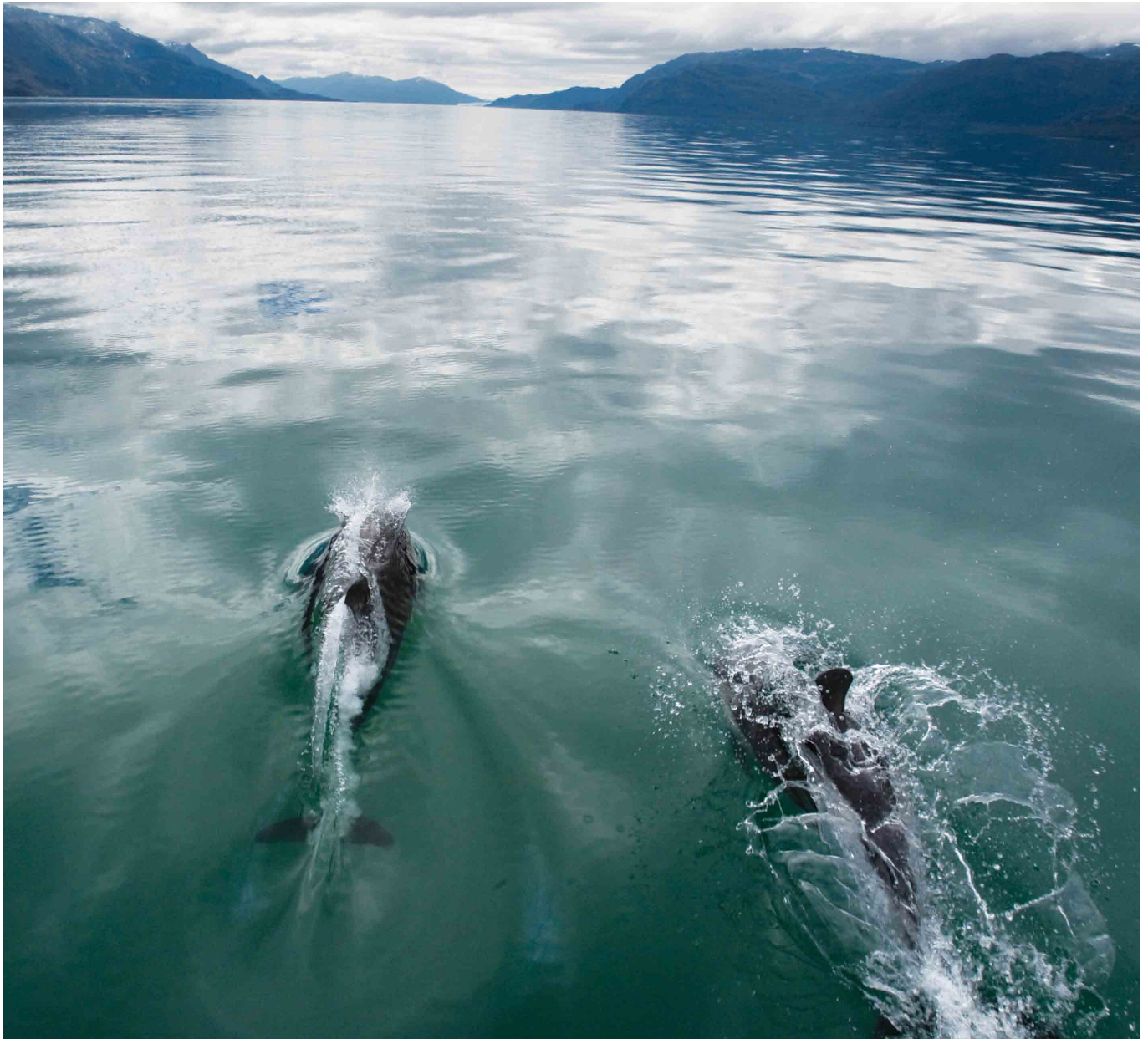
Above: Whale-watching is a popular Patagonia pastime.

Verdant plains roll gently towards jagged, snow-capped spires; rushing white-water rivers flow into impossibly serene turquoise lakes – the region is awash with beautiful severities.