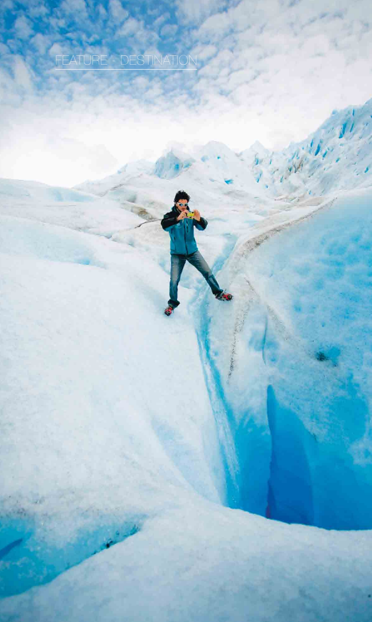
Top left: An ice-trekker uses special traction devices for exploring the glaciers. Below right: The thermal pools at Puyuhuapi Lodge and Spa. Center right and bottom left: Dramatic scenery reigns in Torres del Paine National Park.