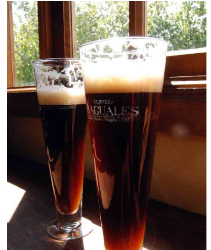
Top left: Mouthwatering delicacies at fusion restaurant Afrigonia. Top right: Cervecería Baguales serves up the finest microbrews in the country.